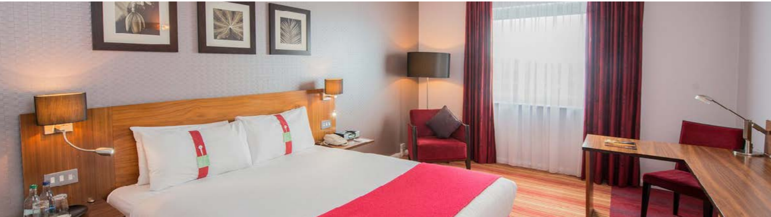
OVERNIGHT AT THE ON-SITE HOLIDAY INN

If you're travelling from across the country or just want to treat yourself to an overnight stay, rooms can be booked directly with the Holiday Inn.